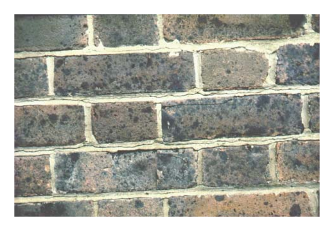
Cracking of the bed joint mortar is characteristic of sulfate attack.

Examples of serious deterioration of brickwork, due to sulfate attack, such as crumbling and erosion of the mortar joint or, in severe cases, expansion, bowing