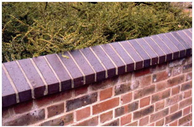
Clayware coping units with a suitable drip are functionally efficient and aesthetically pleasing.