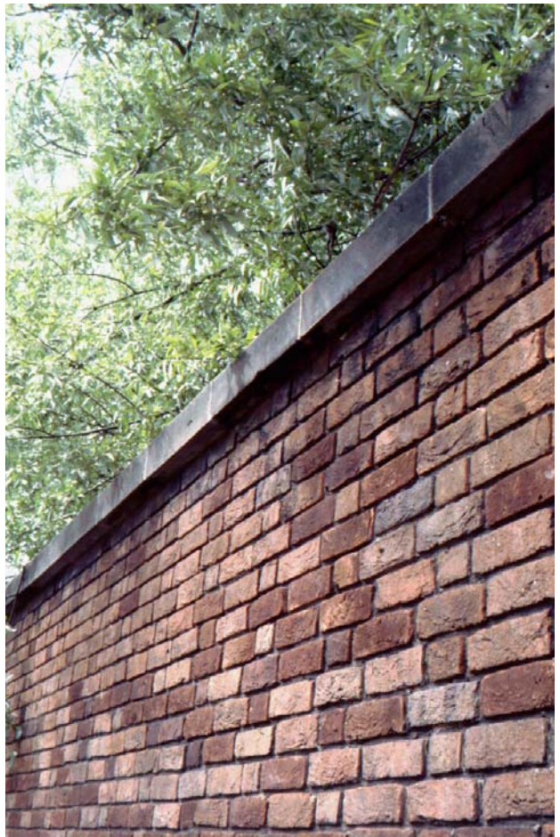
An attractive wall with an effective coping