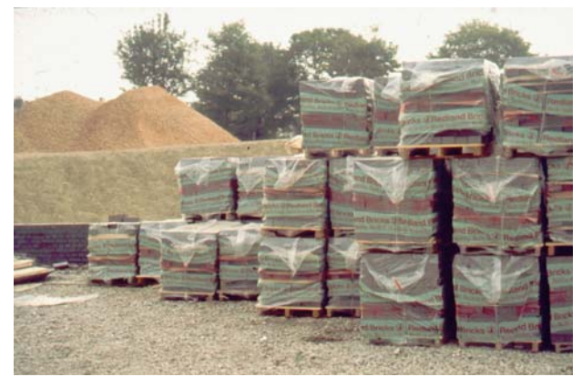
Bricks in a stack protected from saturation. They should preferably be stacked on boards or pallets and protected from splashes by vehicles.

There is little experience of the successful use of any admixture intended to provide frost protection by depressing the freezing point of the mixing water. Some substances that might be contemplated for this purpose (e.g., ethylene glycol) are known to adversely affect the hydration of the cement.