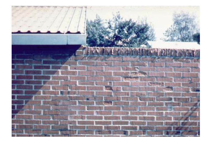
Frost resistant category F1 clay bricks are suitable in the external walls of buildings where protected from saturation. If the protection is omitted, saturation and frost damage may result.

Table NA.5 of BS EN 771-1<sup>4</sup> gives 'BS3921 equivalent' designations for all the possible combinations of categories of frost resistance and soluble salt content. PD 6697^1 prescribes the durability categories recommended in finished constructions. BDA Design Note 7