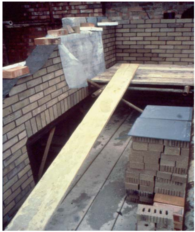
The protection of new brickwork and materials minimises damage due to saturation.