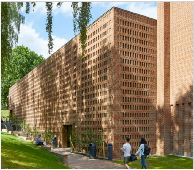
Hit and miss brickwork broken up in to smaller sections by the introduction of beams.

The amount of overlap should allow for the sufficient embedment and mortar cover for wall ties.