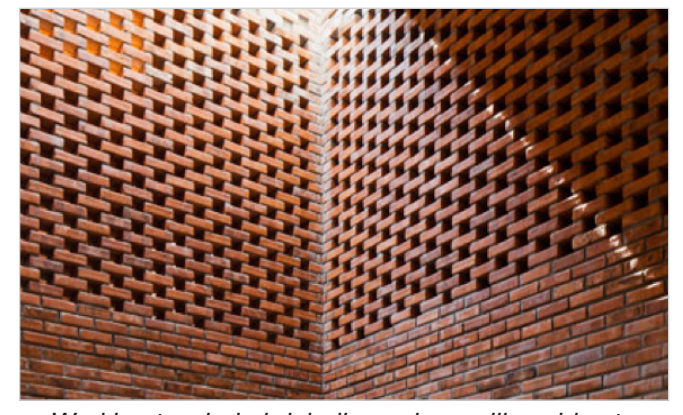
Working to whole brick dimensions will avoid cuts.

BS EN 1996-1-1 should be consulted to ensure that the structural performance of the hit and miss panel is acceptable.